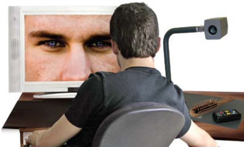
ONYX Swing-arm in self view

The 11 3/8-inch workspace under the camera provides the room you need to work on objects with your hands and tools. Use the Find Feature to aim at a distant object before zooming in. Auto Focus eliminates the need for constant refocusing as the viewing field changes. Use Focus Lock to keep an object or document in focus when working or writing under the camera. The unique Position Sensor function retains